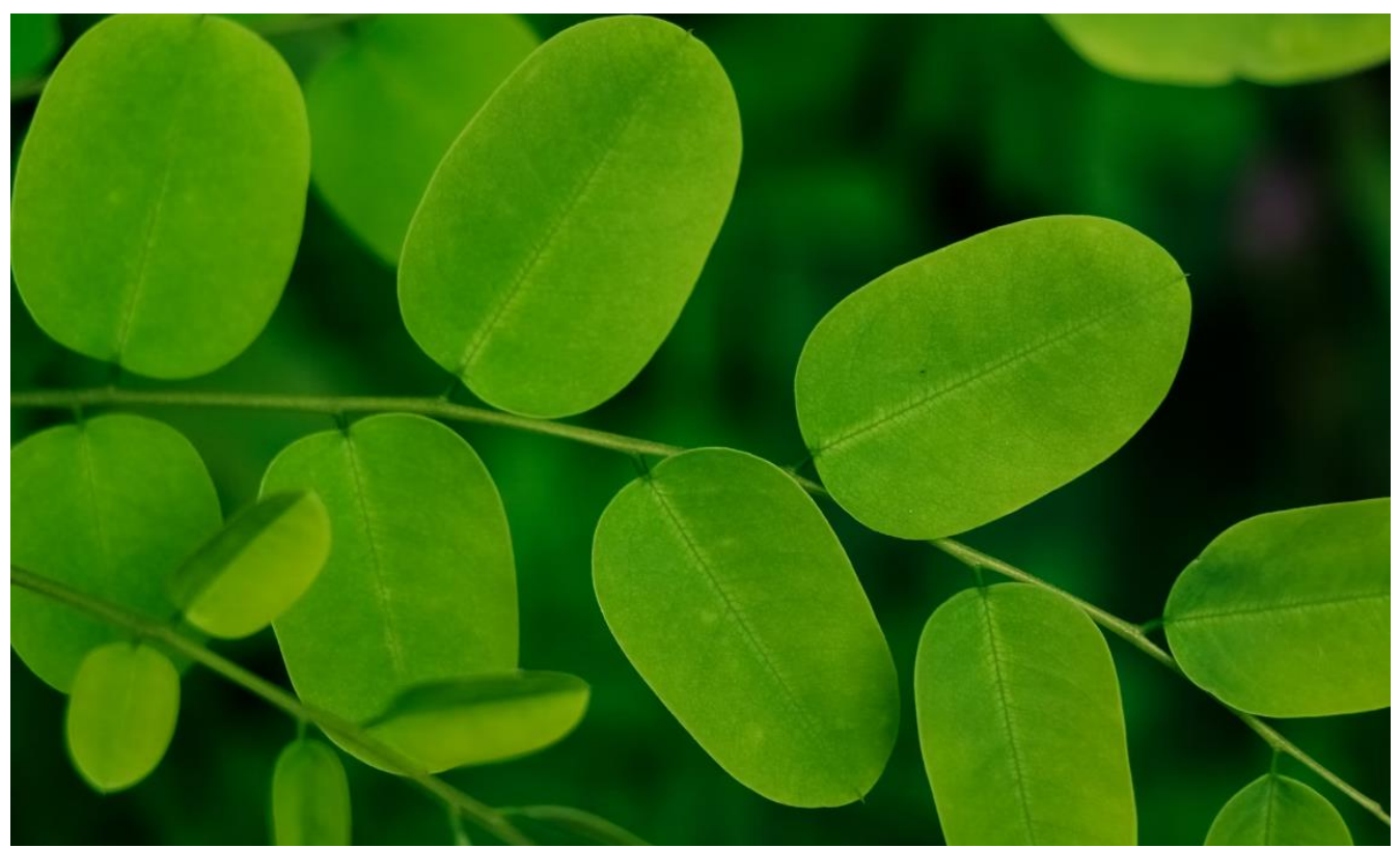
Figure 1. Illustration of Moringa leaf

within the contemporary healthcare delivery system. In an optimal scenario, the informed consent process involves an educational dialogue between a healthcare provider, such as a physician or surgeon, and a patient or their family members, enabling them to make an informed decision regarding their healthcare. The consent form was originally designed as a record of the interaction between the patient and the healthcare provider, and it has now evolved into a legal requirement in the field of nursing. Data collection in this study employed multiple methods, including participatory observation, interviews, direct observation, and documentation review. The data collection tool utilized was the SOP (Standard Operating Procedure) application of Moringa leaf extract (Figure 1). This research employed a quantitative research approach and a case study research strategy. The activities carried out during the study involved directly performing nursing services to the respondent, conducting interviews to collect data, performing physical examinations, and implementing patient interventions using the SOP (Standard Operating Procedure) Application as the data collection tool.