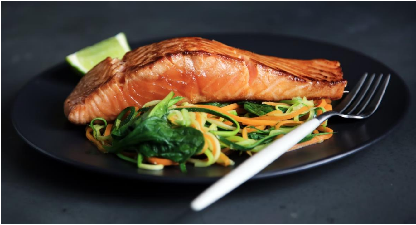
Figure 3. Illustration of healthy food.

A gradual approach to introducing more vegetables into the participant's diet could be beneficial. Start by incorporating small amounts of green leafy vegetables, such as spinach or kale, into the participant's favorite dishes like pasta or rice bowls. Gradually increase the portion of vegetables over time to help the participant get accustomed to the taste and texture. Disguising vegetables in familiar foods can also be an effective strategy (da Silva Lopes, Yamaji, Rahman, Suto, Takemoto, Garcia-Casal, & Ota, 2021). Blend or finely chop vegetables and incorporate them into sauces, soups, or baked goods, like muffins or smoothies, to help the participant consume vegetables without feeling like they are eating them directly. Offering a variety of vegetables, including different colors and textures, can keep the participant's interest and prevent boredom (Skolmowska, Głąbska, Kołota, & Guzek, 2022). Experiment with new recipes and cooking methods, such as roasting, sautéing, or grilling, to make vegetables more appealing. Involving the participant in meal preparation, such as grocery shopping, meal planning, and cooking, can foster a sense of ownership and investment in the meals, making them more likely to try the