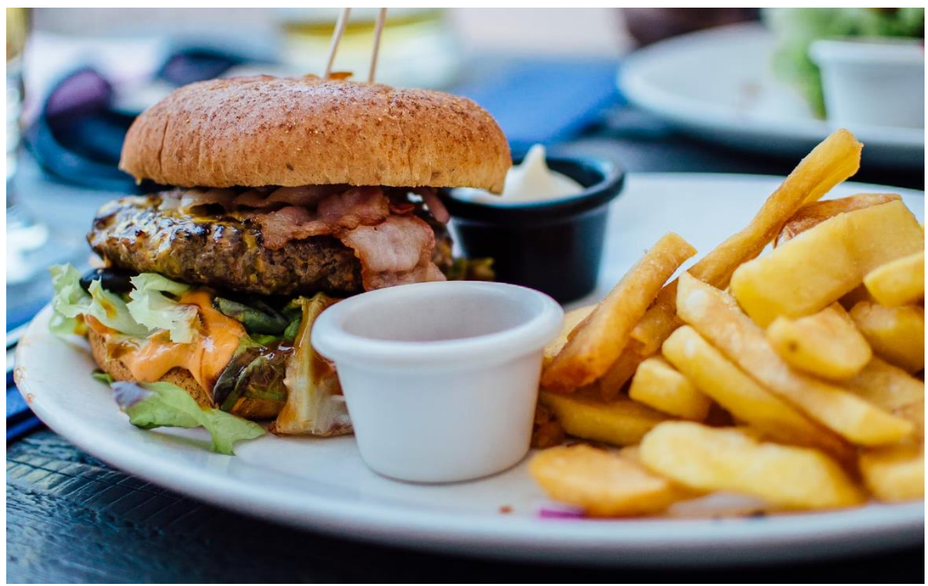
Figure 2. Illustration of junk foods.

Teenage girls are one of the groups particularly vulnerable to the problem of nutritional deficiencies. Nutritional status can be defined as the state of balance between the consumption, absorption, and utilization of nutrients. A deficiency of macronutrients, such as energy and protein, as well as a lack of micronutrients like iron (Fe), iodine, and vitamin A, can lead to nutritional anemia, where the deficiency of specific nutrients, especially iron (Fe), affects the formation of hemoglobin (Hb) or red blood cells (Lestari et al., 2018). The participant's symptoms, including easy fatigue, pale appearance, lack of energy, dizziness, and palpitations during increased activity, as well