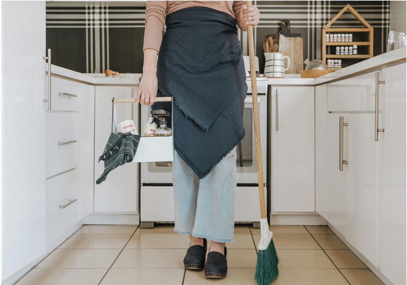
Figure 3. Illustration of womens' daily task.

progresses, the increasing uterine load leads to stretching in the back, contributing to discomfort. According to Handayani (2020), weight gain during pregnancy can cause the bones responsible for supporting the body to experience issues. Additionally, the mother's posture changes as a compensation for the increasing duration of pregnancy, which is a common cause of back pain in third-trimester pregnant women (Diana, 2019). Daily activities performed by Mrs. P, such as working and managing household tasks, can lead to pathological changes characterized by pain that worsens with movement (movement pain) and pressure pain, particularly due to improper sitting, standing, and walking positions. When engaging in household chores, these activities often place pressure on the lower back area, negatively impacting the pregnant mother's ability to perform daily tasks effectively (Figure 3).