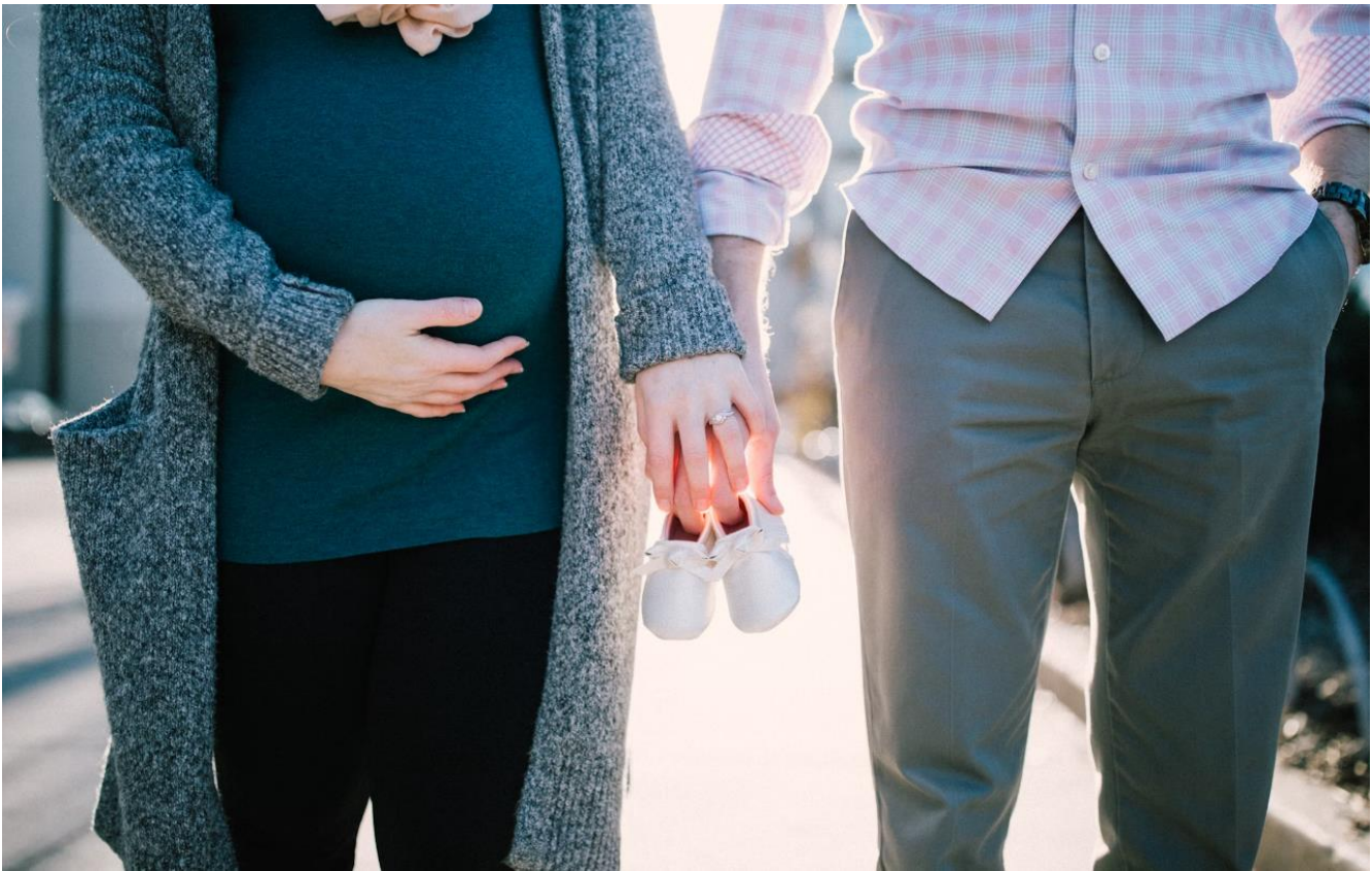
Figure 2. Illustration of pregnant women.

had effectively alleviated her discomfort. Notably, the intervention also contributed to enhanced sleep quality and reduced protective behaviors. The findings suggest that endorphin massage can be an effective complementary therapy for managing acute back pain in third-trimester pregnant women, providing a valuable non-pharmacological option for pain relief during pregnancy ( Figure 2 ).