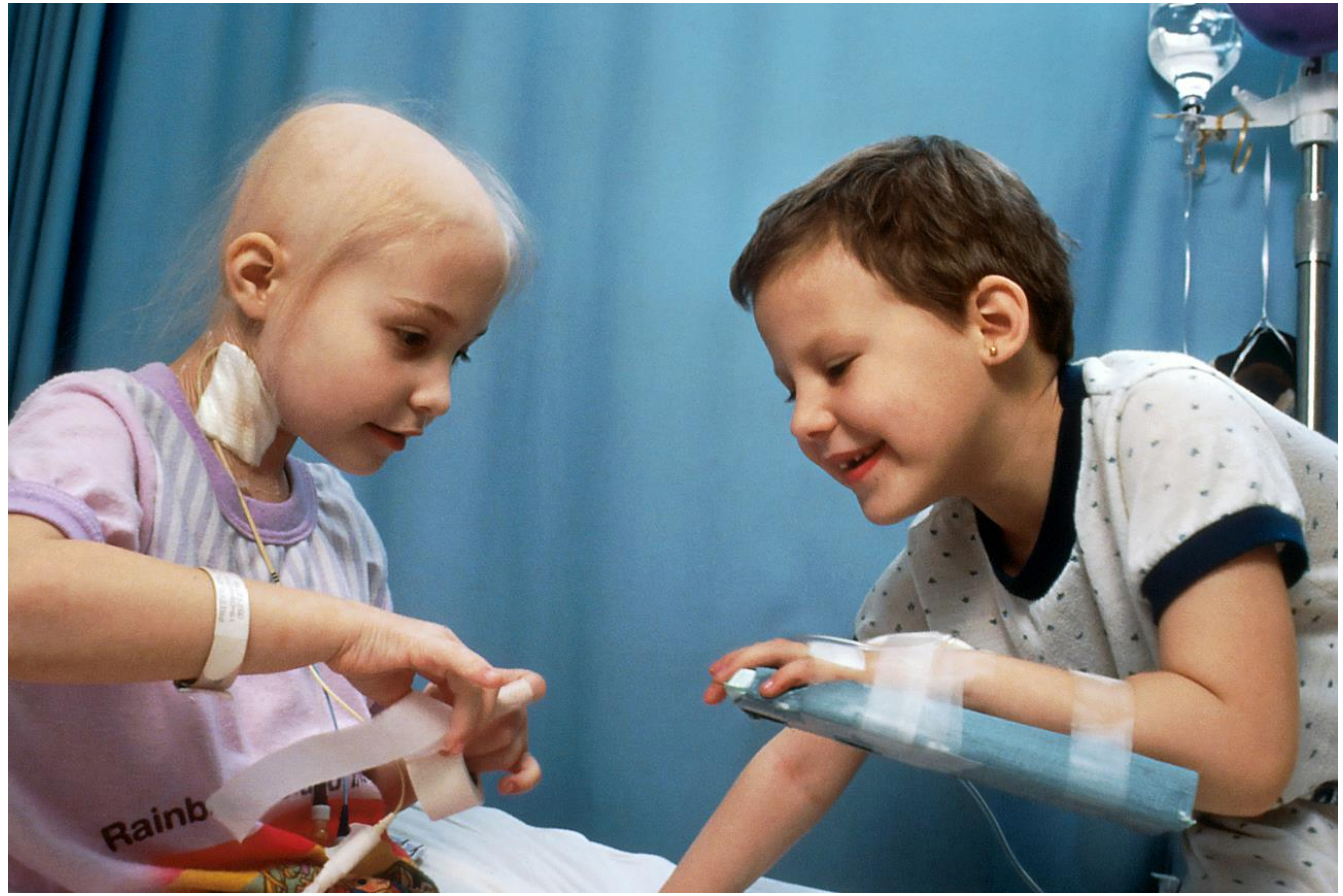
Figure 3. Illustration of patients' uniqueness.

related to transportation and accessibility, allowing patients to consult with healthcare providers from home. Additionally, community-based platforms that connect patients with local resources, support groups, and educational programs can address social determinants and foster a supportive environment for engagement. Patients have unique needs and preferences, and a one-size-fits-all approach may not resonate with everyone. Innovative solutions like personalized health plans, tailored communication strategies, and Al-driven tools that analyze patient data can help create individualized care experiences ( Figure 3 ). Healthcare providers can enhance engagement and satisfaction by considering each patient's background, preferences, and health goals. Many patients feel their concerns and feedback are not adequately addressed, leading to frustration and disengagement. Implementing innovative feedback systems, such as real-time surveys or interactive platforms for patient input, can help healthcare providers understand patient experiences and make necessary adjustments. Engaging patients in co-designing care processes can also foster a sense of ownership and commitment to their health journey (Clavel et al., 2021).