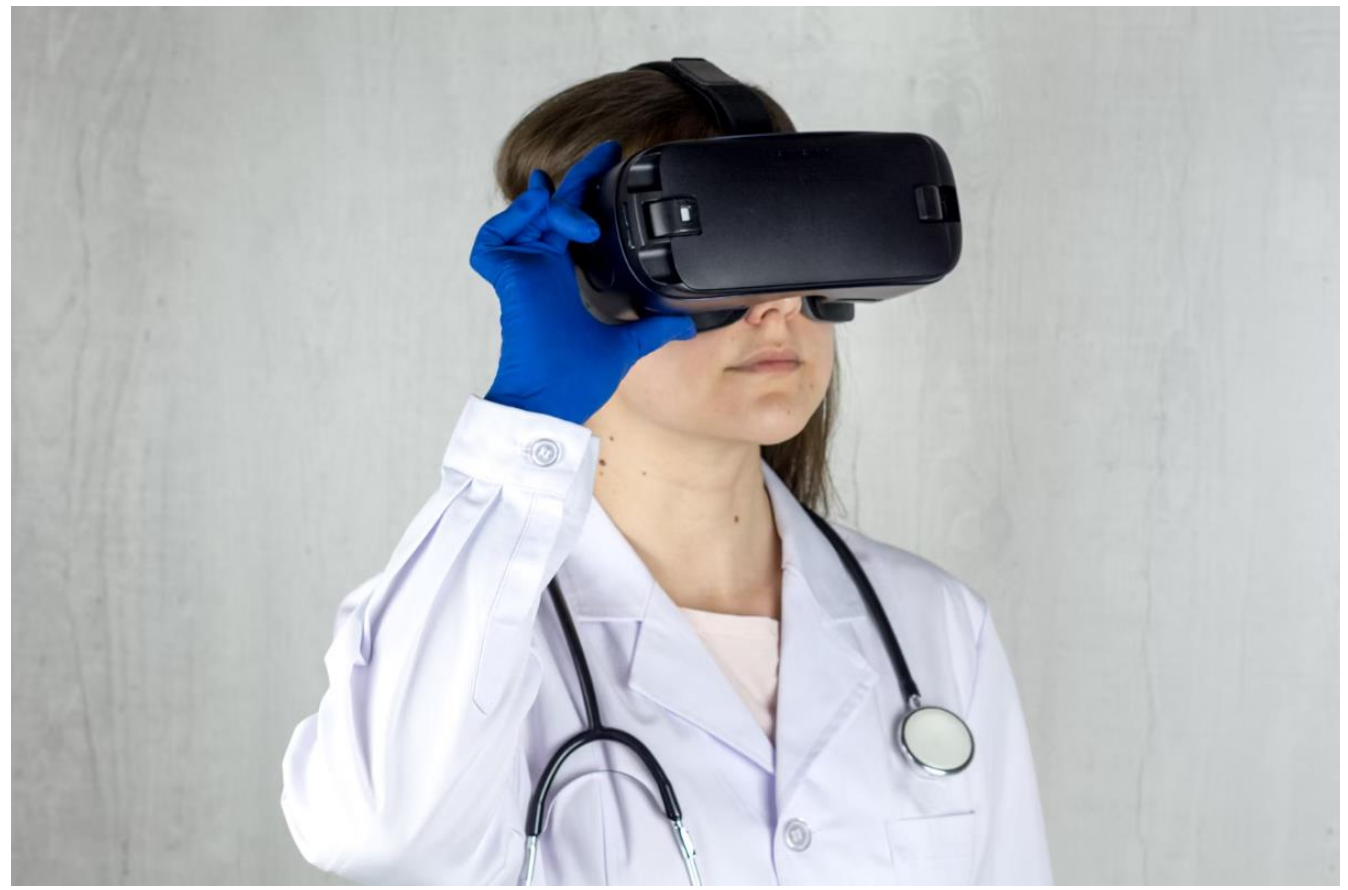
Figure 2. Illustration of health innovation (Courtesy of unsplash.com).

and clinical processes positions them uniquely to identify gaps in existing treatments, technologies, and workflows. This insight is crucial for fostering innovations that are not only effective but also practical and user-friendly (Flessa & Huebner, 2021). For instance, nurses and physicians often encounter challenges in patient management that can be addressed through new technologies or processes (Stoumpos, Kitsios, & Talias, 2023). Healthcare professionals can help shape innovations that meet real-world needs, ensuring that new solutions are grounded in clinical reality by providing feedback and collaborating with engineers and researchers (Figure 2). Moreover, healthcare professionals are essential in the implementation and dissemination of innovative practices (Andersson, Linnéusson, Holmén, & Kjellsdotter, 2023). Their credibility and authority in the healthcare setting enable them to advocate for new technologies and treatment methods among their peers (Milella, Minelli, Strozzi, & Croce, 2021).