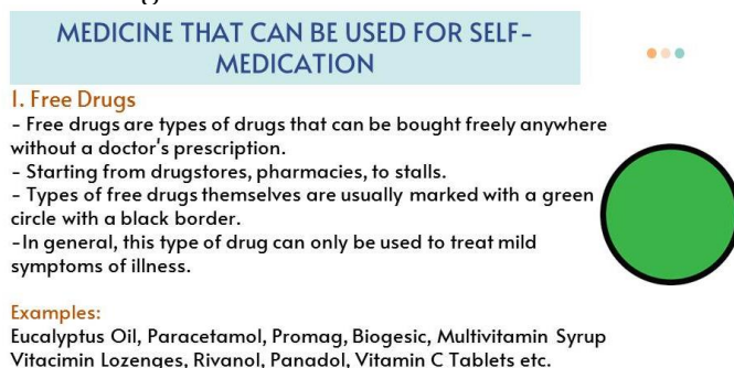
Figure 1. Self-medication materials in the powerpoint presentation

pharmacists and how to follow the rules listed on the packaging if using over-the-counter or limited-free drugs.