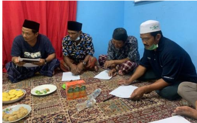
Figure 3. The participants answering the posttest