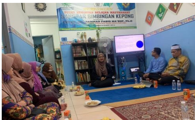
Figure 2. The explanation of self-medication materials

The counseling program was opened by the Head of the Kepong Learning Center. Then, the the participants were instructed to fill out a pretest questionnaire before the material was delivered. Self-medication material is the main topic, however, participants were also given the main material on basic self-medication of minor illnesses which commonly occur in the community, including fever, cough, and diarrhea. These diseases are the most common diseases in the community and the initial symptoms of first aid at home. Figure 2 shows that the participants were paying attention and listening to the materials delivered by the presenter. The participants occasionally asked questions to the presenter. From the observations, it can be perceived that the participants expressed their interest in the materials by sharing their own experiences when doing self-medication at home. The thing most asked by the participants was how to use and store medicine properly at home.