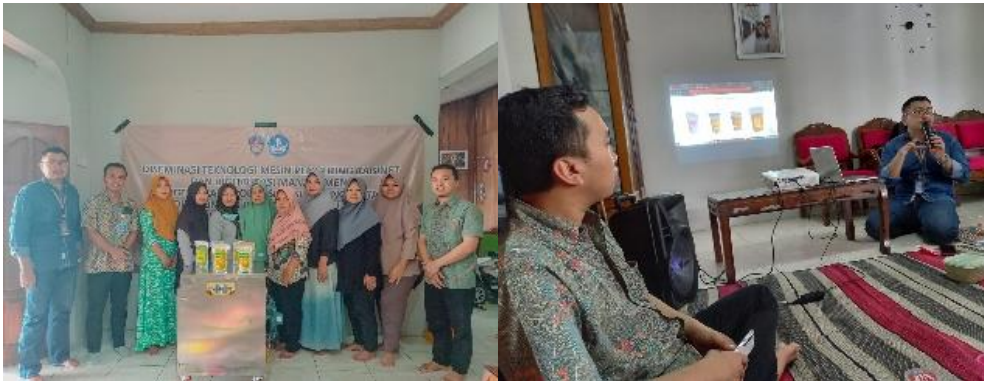
Figure 1. Training activities

In this training, participants were given material about selling online through e-commerce (Figure 1). E-commerce is an electronic product marketing platform that brings together many sellers and buyers to transact with each other.