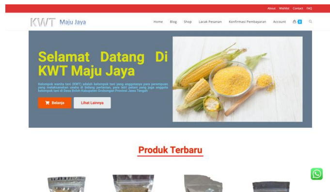
Figure 2. The main menu of KWT Maju Jaya Store

The main page view can be seen in Figure 2. The main menu is a page that can display a list of collection images. In each image there are 2 (two) buttons, namely: 1) "Add to Chart" button, and 2) "View Details" button. If the buyer is interested in buying the item, it can be done by pressing the "Add to Chart" button. If the buyer wants to see the details of the product, they can press the "View Details" button.