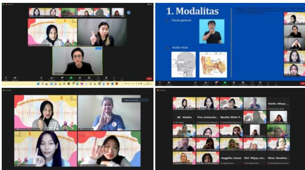
Figure 1. Documentation of AJAR UP 2021

and discussions, especially during sign language learning activities in the second session. However, there were several obstacles experienced before the day of the activity where the registrants for this AJAR UP activity were 48 people. Still, at the time of the announcement, only about 30 people entered the WhatsApp group created. The group link was announced via the email platform so that many participants do not open the email provided and do not join the group link provided in the email. These obstacles made the number of participants who attended the AJAR UP activities only about 28 participants. Meanwhile, on the day of the activity, the obstacle experienced was the lack of stability of the committee signal at the beginning of the activity, namely during the open gate session. The share screen had stopped for a while, the MC and the committee could resolve this by providing information about initial attendance through the Zoom chat column.